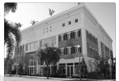
EcoCentre is located at 1005 Lake Avenue

EcoCentre’s nature-based systems will save approximately 200,000 gallons of water per year, reducing its impact on the city’s water infrastructure by recycling water from lavatories and showers, capturing and storing rainwater, and using water-efficient plumbing fixtures and condensate capture from its air-conditioning system.