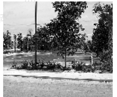
Newly completed parking lots feature lush landscaping, upgraded drainage and lighting