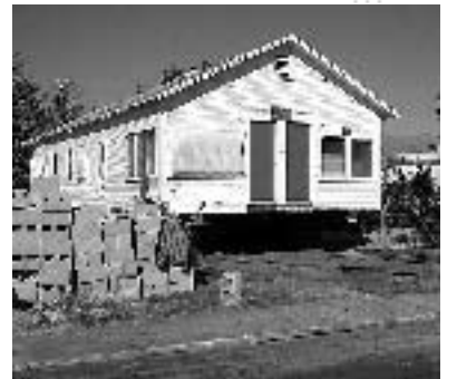
South L Street historic structure prepared for relocation

Retail business attraction has become a high priority for the Lake Worth CRA. The purpose of this parking lot project was to facilitate construction of new retail space on Lucerne Avenue while providing additional parking to support our businesses. To that end, the Lake Worth CRA is in the process of developing a comprehensive parking strategy to better manage and provide for future parking in the Downtown.